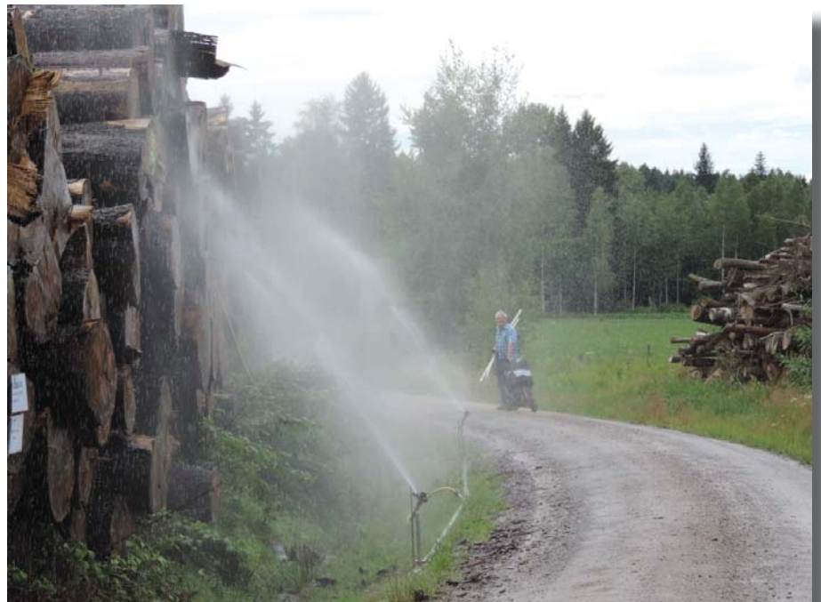
Konrad DH6RAE getting the final shower

http://blog.winqsl.com http://www.u23.de http://www.qrz.com/db/da0cw