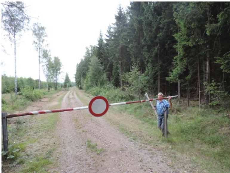
way into the area

DAØCW/p NSG Pfrentschwiese DLFF-0307 355 contacts