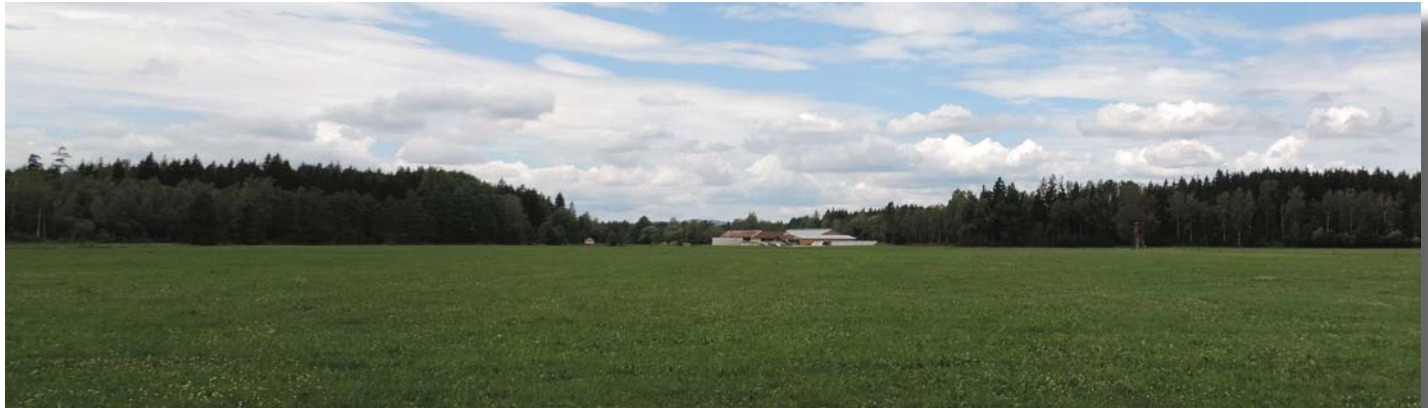
View to Pfrentschweiher on our return-way

no good possibility to set up the additional equipment. Finally we also decided with the incalculable weather not to go to czech and instead extend the german operation a bit. In the 3 hours we finally got 355 stations into the log, using 40 and 20 SSB only. Altogether 29 countries with 82 contacts to germany, 66 to italy and 44 to poland made it a successful trip. Last contact was with PA3KOE.