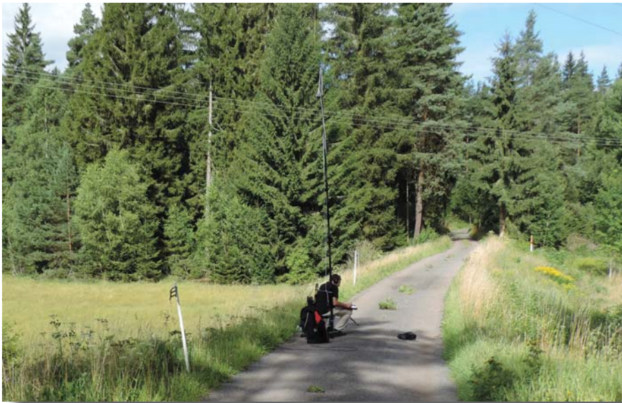
Manfred DF6EX on the station

IK2YXH as latest station and prepared everything for the homeway. The activity was a great success, we finally could work 33 countries, with the top 3: Germany with 103 followed by poland with 69 and third place this time went to italy with 52 contacts.