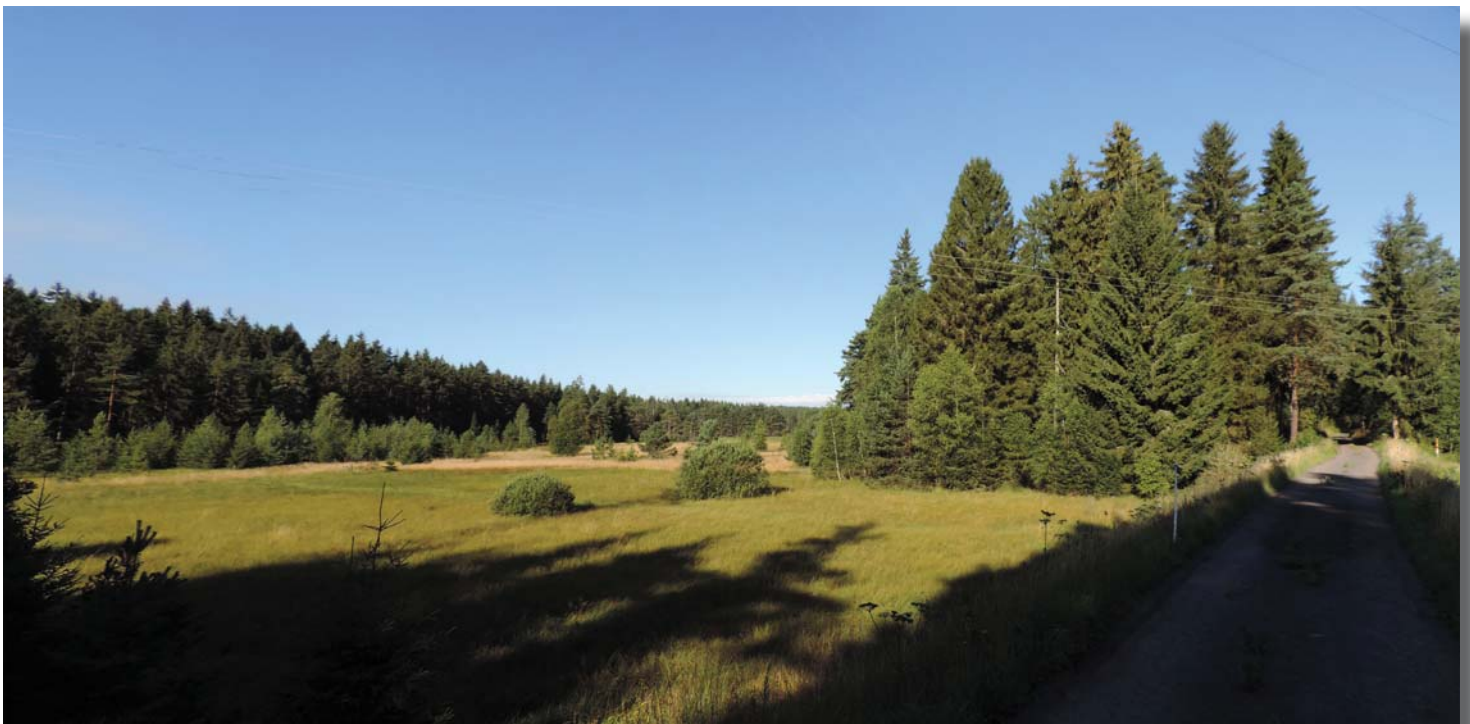
view from our nature-shack

see you next time Manfred DF6EX, Konrad DH6RAE