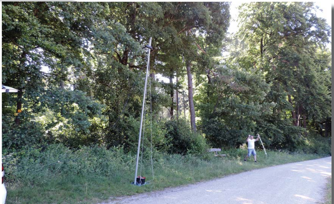
antenna setup in the nature-reserve

http://blog.winqsl.com http://www.u23.de http://www.qrz.com/db/da0cw