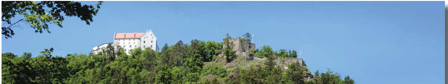
The scenery above Riedenburg shows Castle Rosenberg left (DL-02833) with castle Rabenstein beside