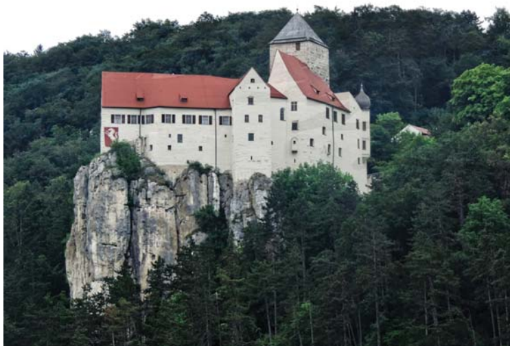
The castle on its imposant rock above the valley

Top-country was italy with 43, followed by poland 25 and germany on third with 22. After 1,5 hours activity, the interest was getting smaller and we finally ended the activity with a total of 181 contacts into 27 countries.