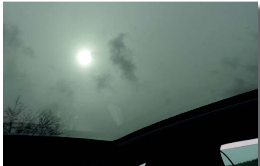
sometimes sky appeared very unfriendly but no more rain

Weather was quite windy meanwhile and we were high located but the best thing was no more rain. So after the quick setup we started at 1205 UTC back on 40 meters, we used this time our club-callsign DAØCW/p and the first station which replied was IK1GPG. The austri-