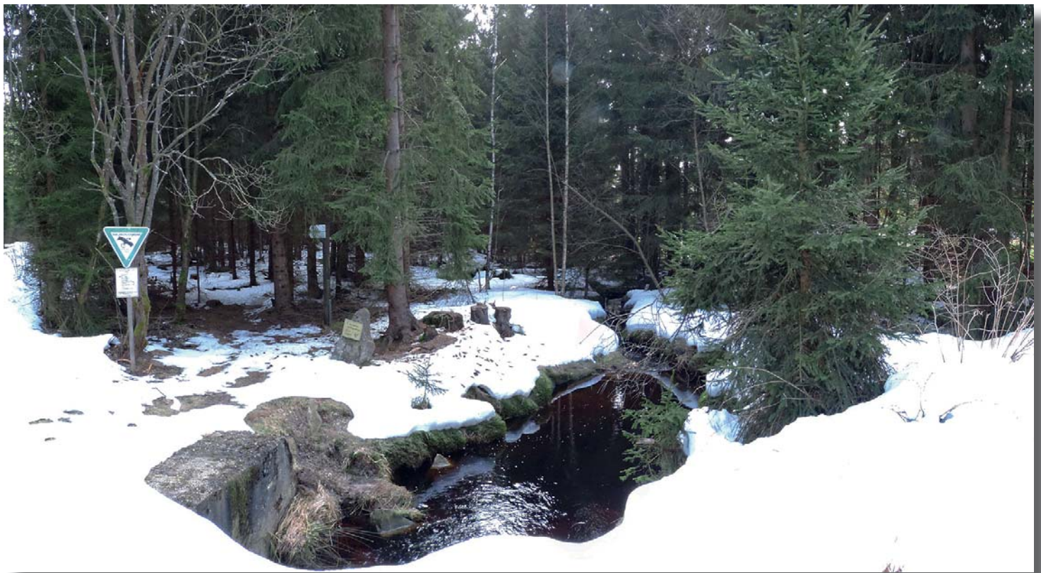
first entrance to DLFF-289

Naturwaldreservat Fichtelseemoor with a size of 139 ha at about 750meters asl was elected in 1982 (in it´s current size). The highmoor is a relict from last ice-age with an age between 8000 and 10000 years. There was a big dewatering during the past centuries but a lot of species especially typical for moor-areas could survive.