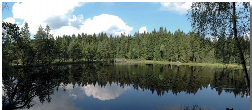
Fichtelsee bordering to the moor-area