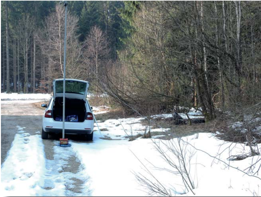
„cool“ shack for 2 hours

Nature Reserve Naturwaldreservat Fichtelseemoor