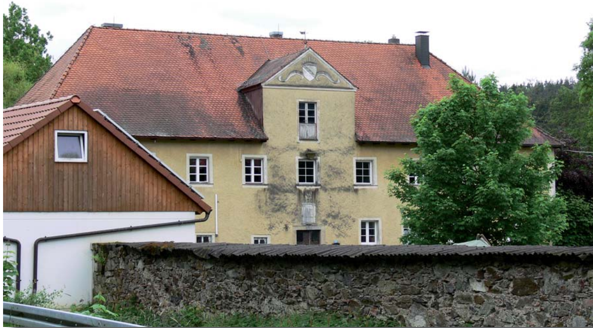
Castle of Trautenberg

The castle of Trautenberg was originally a castle built on a hill by the royal house of Trautenbergers. They were first time named in the 10th century and the castle of Trautenberg was one of the oldest castles in southern germany.