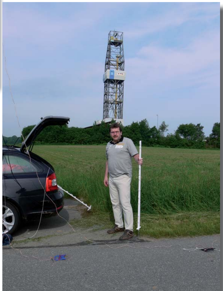
preparing setup behind the drilling-tower

Flora-Fauna-Committee-member World Castle Activator Group #036 COTA-Team-Germany #037 COTA-Team-Russia COTA-RU #011 SP-CFF-member #029 SP-CFF-honorary member #004