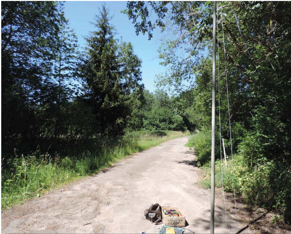
view from our DLFF-0557-shack

Until 1980 this was a mining area for iron ore. In the whole area you find ground-rejections caused by collapsed cavities as a result from the mining activities. The area belongs in IUCN-category IV and is under protection since 1996.