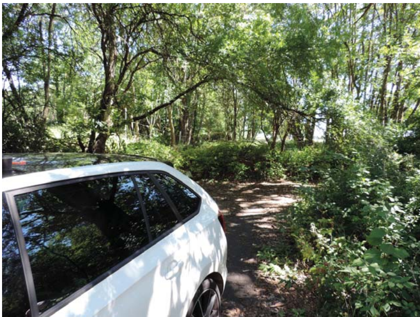
close to the anthill

Thanks to Konrad DH6RAE for the participation and see you from another trip.