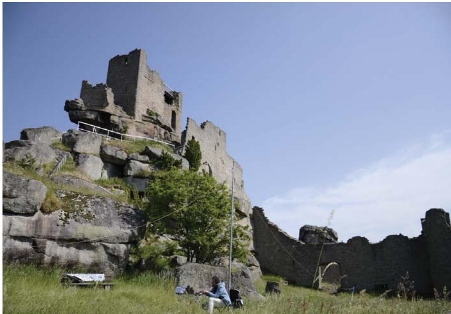
Manfred DF6EX on the first station under the main-castle