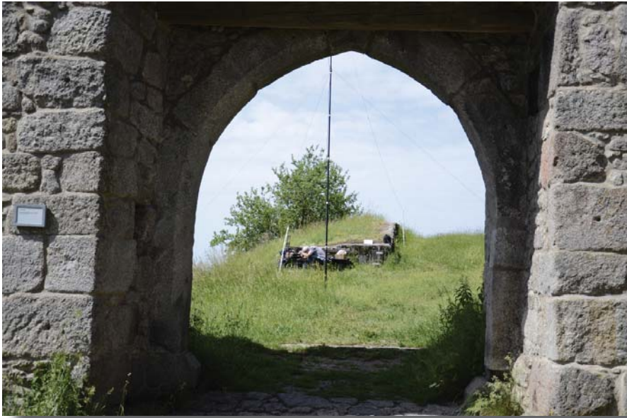
entry into the main-castle area

spotted us in the cluster. The uploads into the international databases are done. The printed QSL-card with the special DOK WCA 10 will follow later this year.