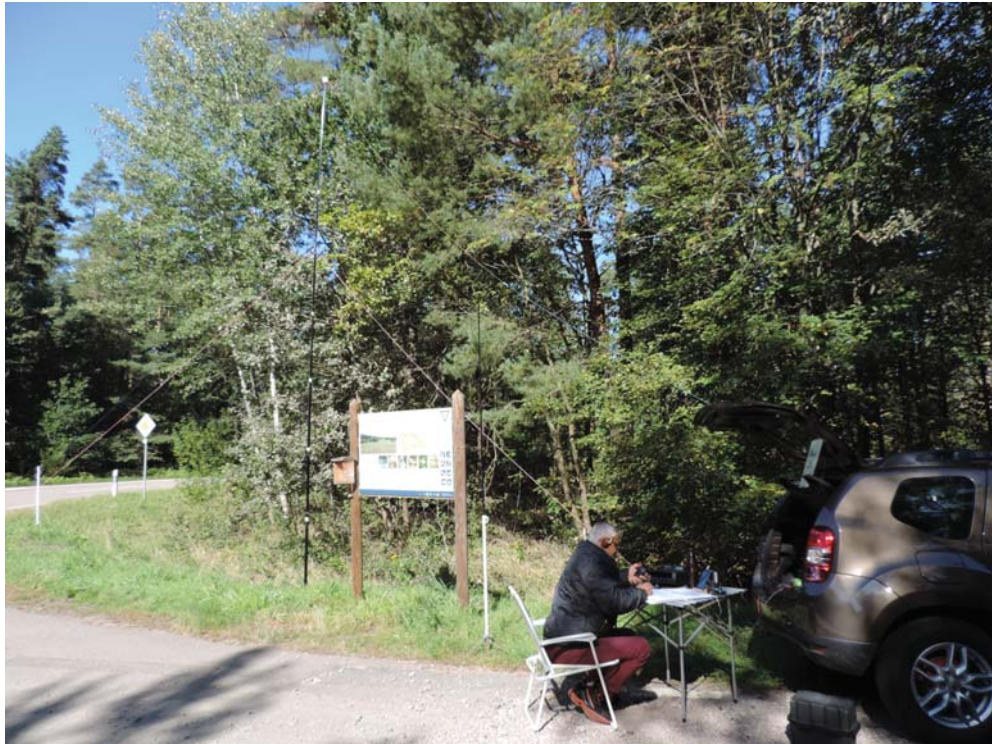
Konrad DH6RAE running 20 meter station

the third hour 115 QSO. Then it dropped down dramatically. In the last 30 minutes we had just 46 QSO. Around the end there was a good shortskip opening on 30meters which produced 599 signals from belgium, netherlands and germany. We announced it separately in the cluster but not too many took notice.