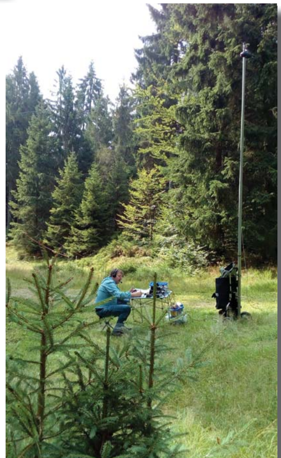
amateur-radio in pure nature

Then after a bit less than two hours the totally unexpected happened. One of our batteries crashed and brought one of our stations out of business. Anyhow we had no spare battery with us, the way back would have been to heavy and