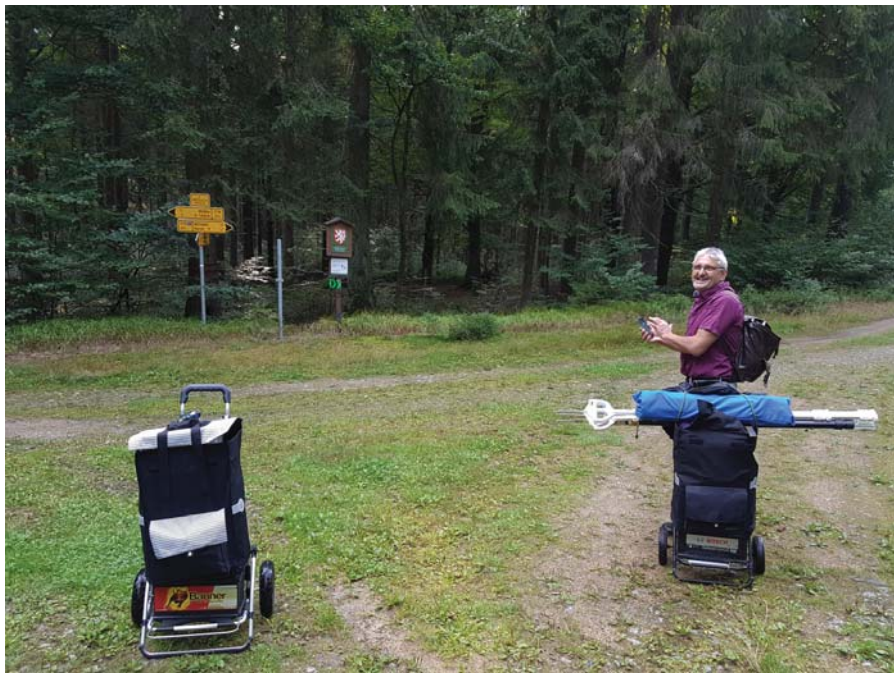
arriving at location

too long to make a change, so we could continue with one station only. However this had also a good side-effect.