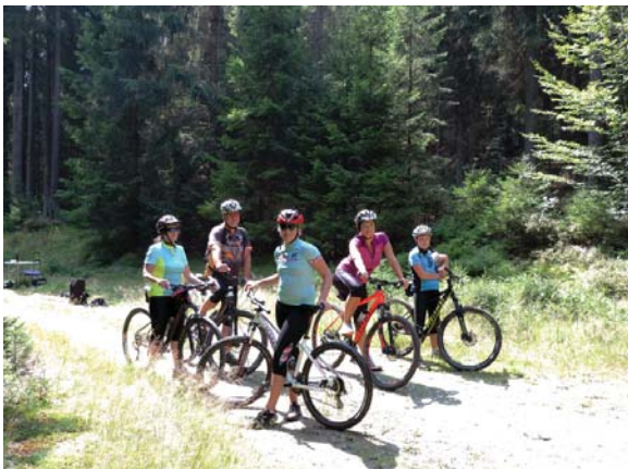
visitors from Oberpfälzer Waldverein came along to see what happens in the middle of the nature

Of course after the activity is before the next one. So lesson learned. Next time we will have three batteries on