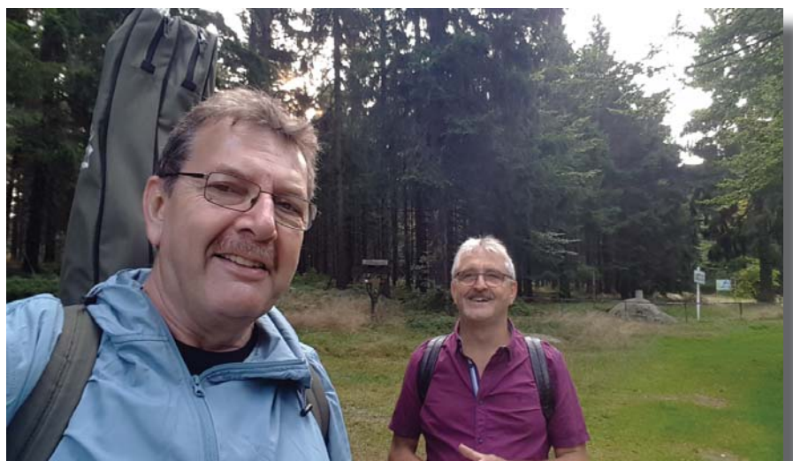
leaving germany with all our gear

From our start until erecting the antennas almost 1,5 hours were over and it was time to start the