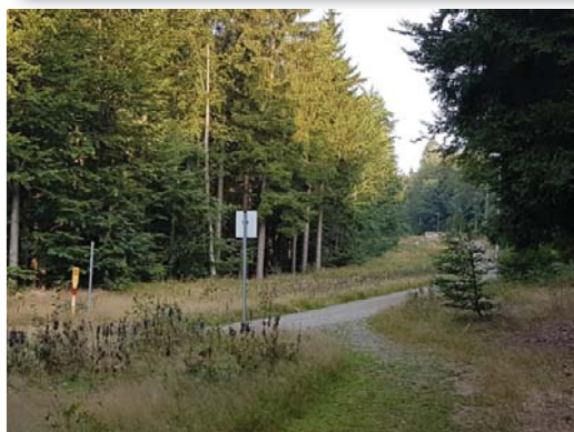
leaving back home along the ski-trail