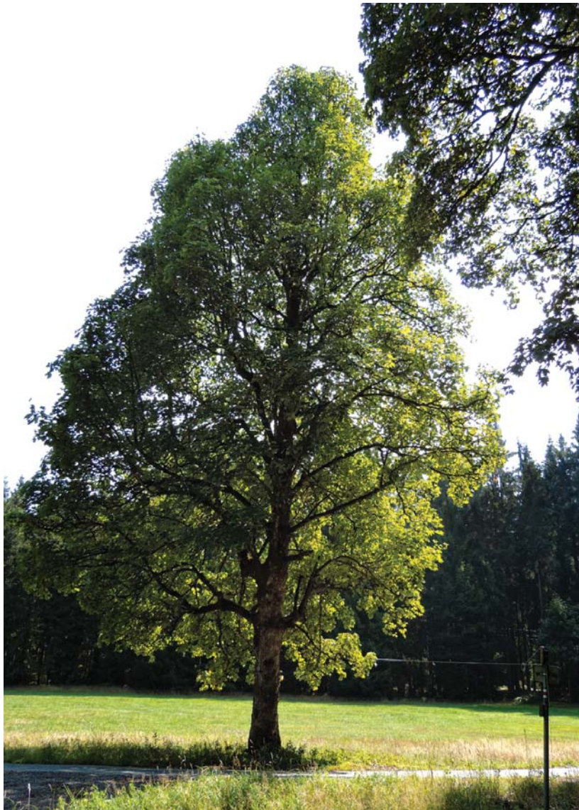
majestic tree with one end of our wires beside

OKFF-0800 was the operation in 2019 which needed the longest time for preplanning. We were altogether four times by foot in the area to find an acceptable way and a location. The first two attempts were totally unsuccessful. On attempt 3 and 4 we finally fixed the problem and found also a way to reach the area.