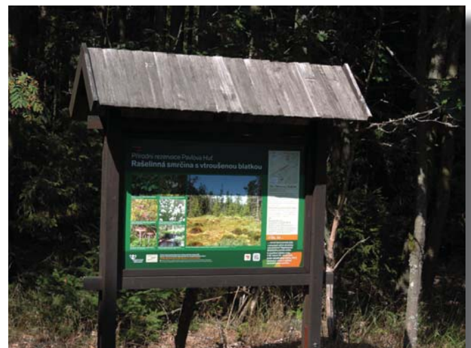
entry to the nature-reserve

73, 44, 11, Team DA0CW Ortsverband Stiftland virtueller OV für WWFF u. COTA-Freunde https://www.u23.de