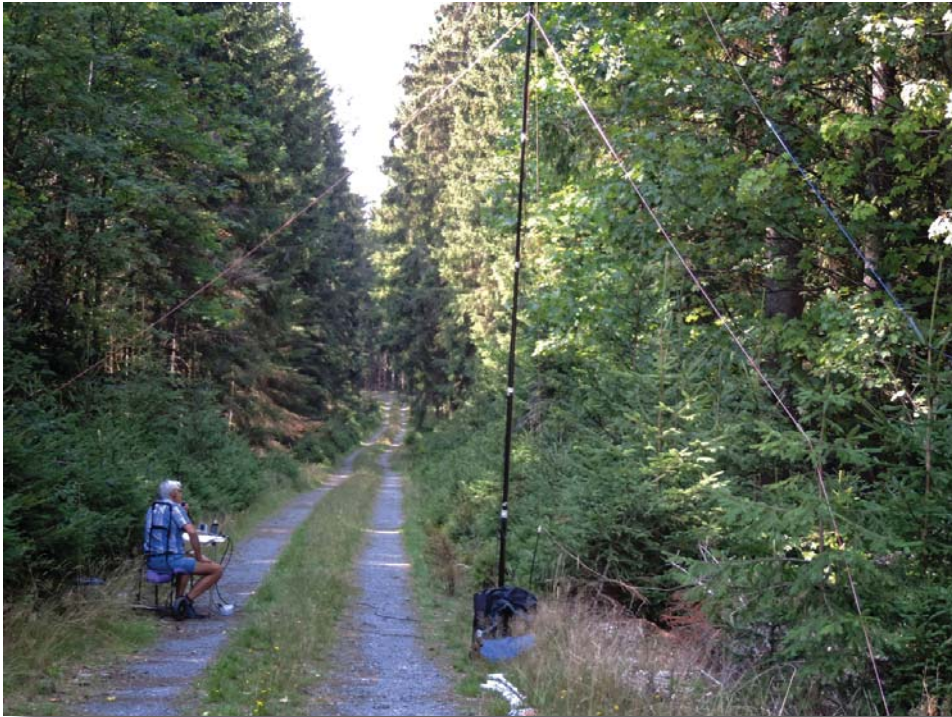
Konrad OK/DH6RAE/p in action

distance from each other which generated us during the day also some difficult working conditions. Biggest problem however was the dramatic degradation from the conditions compared with one week before.