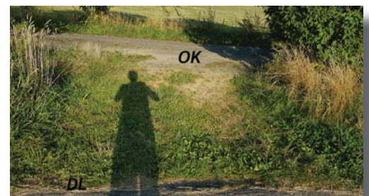
green walk from DL to OK

The place for our two stations was limited, so we had not too much