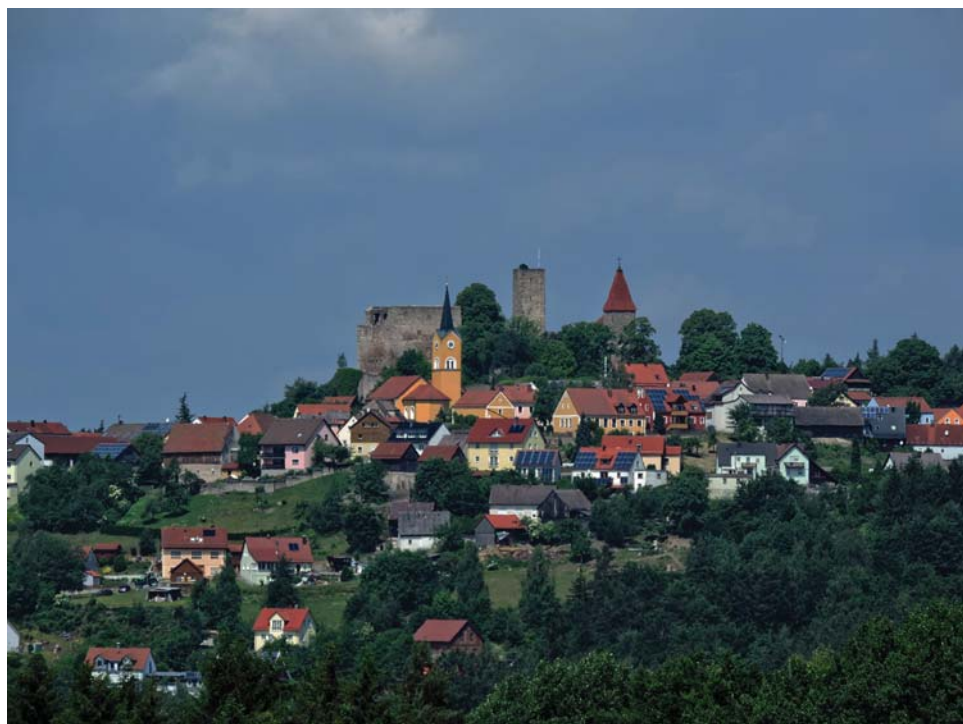
Castle Leuchtenberg DL-02339

After calling a minute or so DJ1SD came back as first station in the log and then within 5 minutes the next appearing callers were louder and louder until the usual signal-strength almost was reached.